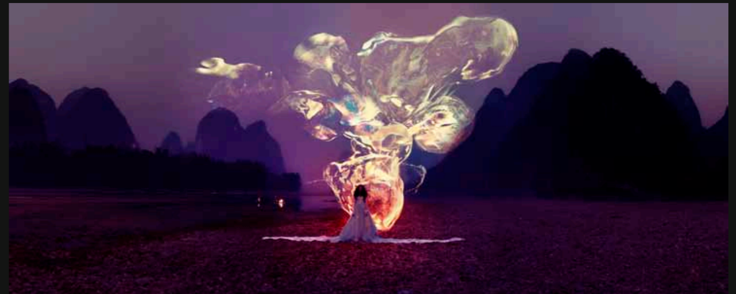
Heart of Zest