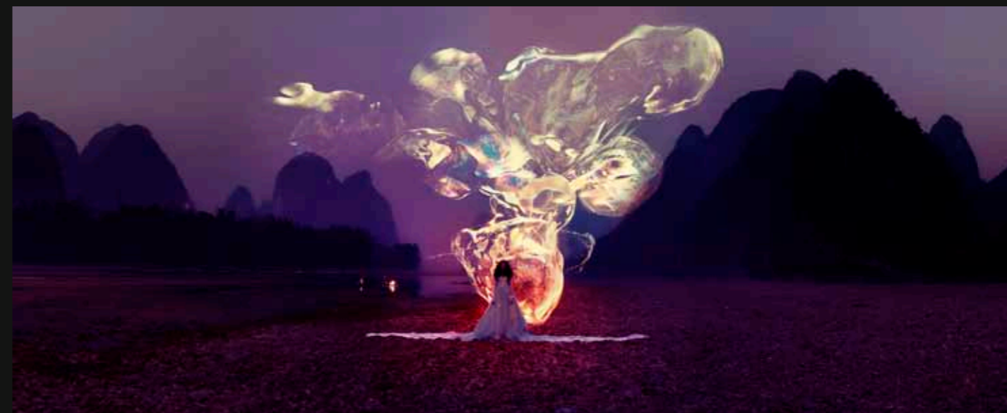
Heart of Zest