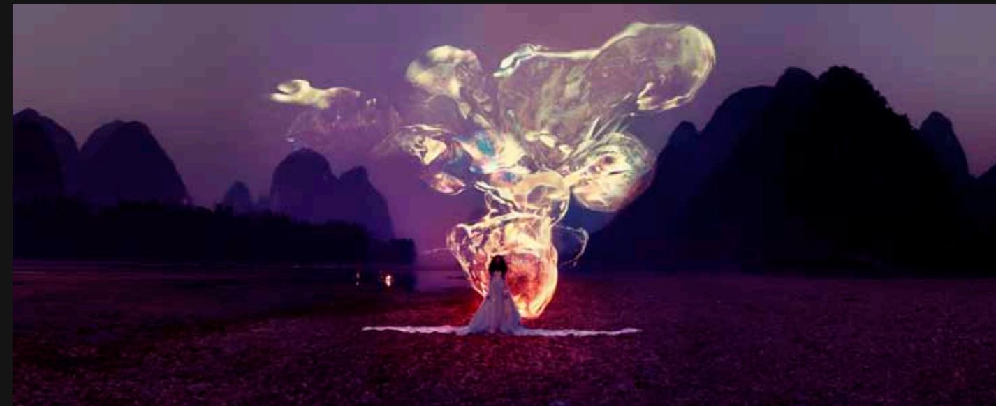
Heart of Zest